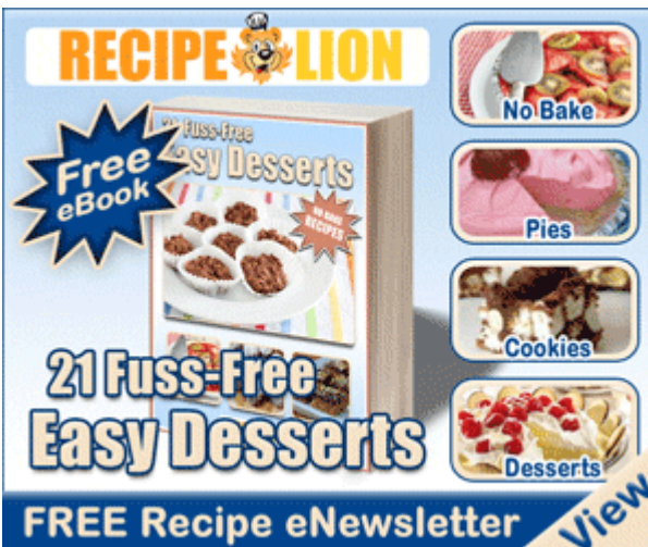
21 Fuss-Free Easy Desserts Free eBook