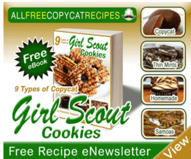
9 Types of Copycat Girl Scout Cookies Free eBook